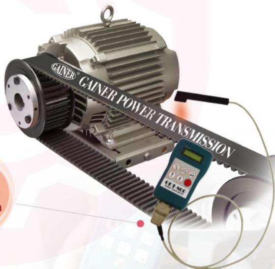
延伸型 Measuring probe with cable